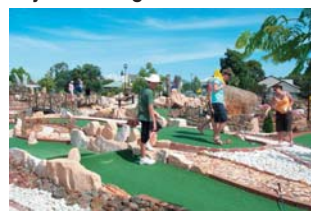
The mini golf course at Toys

One of Horsham's newest attractions has been added beside Toy's Chinese Restaurant on Stawell Rd with extensive Chinese Gardens and a wonderful mini-golf course which is one of the most challenging and interesting you will see. Set on a large area of land with landscaped walks, a small lake with a bridge across it and numerous plants and shrubs set amongst local stone, the gardens are attractive and restful. Restaurateur Leon Toy has been developing the project for several years and it is now reaching completion. It will become one of the most visited attractions in the region and is well worth a visit and a round of the mini-golf course which can be arranged through the restaurant.